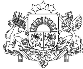
state Latvian Republic