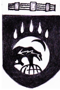
order Godland Östersjöväldet