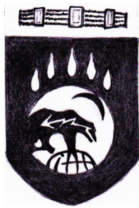
order Godland Östersjöväldet